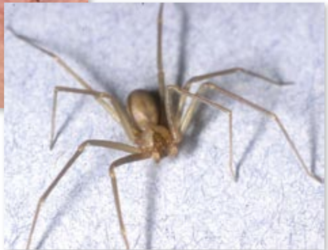
In Canada, hobo spiders (top) are found only in southern British Columbia. Contrary to popular belief, they are unlikely to bite and have never been reliably implicated in dermonecrotic lesions.